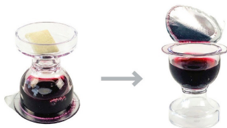
STEP ONE: Open bottom seal. Take and eat.