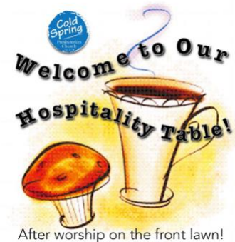
After worship on the front lawn!