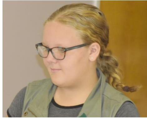
Craft and Gift Fair Pictures